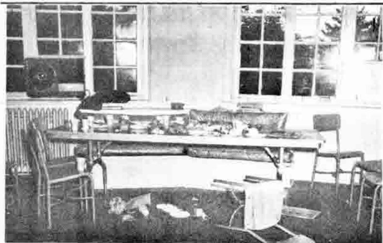
THE REMAINS of a session with the elite citizens of the crumbloafianited society in the St. Louis Campus student lounge.