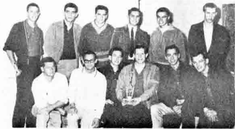
THE TWO TEAMS who will represent the St. Louis Campus in intercollegiate competition at the Arena Bowl tomorrow are shown above holding on of the trophies they hope to bring back to the Campus.

Tomorrow, October 13, the St. Louis Campus Bowling team will begin league competition at the Arena Bowling Alley.